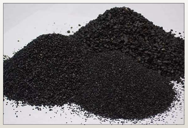
Post Industrial Waste